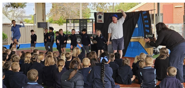
The students enjoyed the recent 'The Bully Is Back' performance.

I wish to acknowledge the supportive families that provide me with ongoing encouragement and feedback. I often reflect on the many media